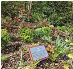
Centenary Garden care