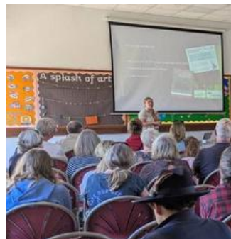
Hedgehog Highways Launch