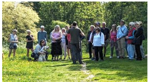
Tours of the Arboretum