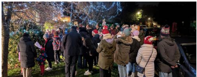
Community Carol singing...