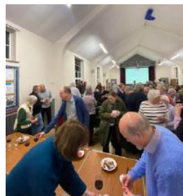
The AGM 2025