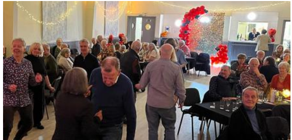
Valentines jazz night